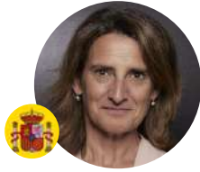
Teresa Ribera Third Vice-President Spanish Government and Minister for Ecological Transition and the Demographic Challenge SPAIN